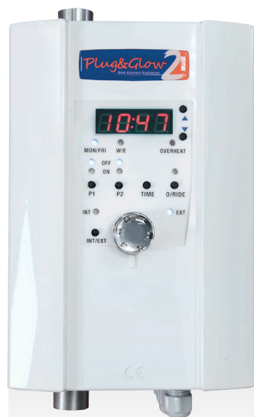
Plug & Glow 2