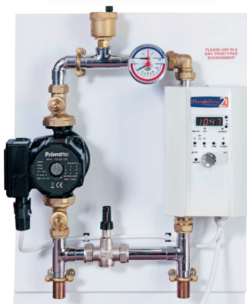
Plug & Glow +